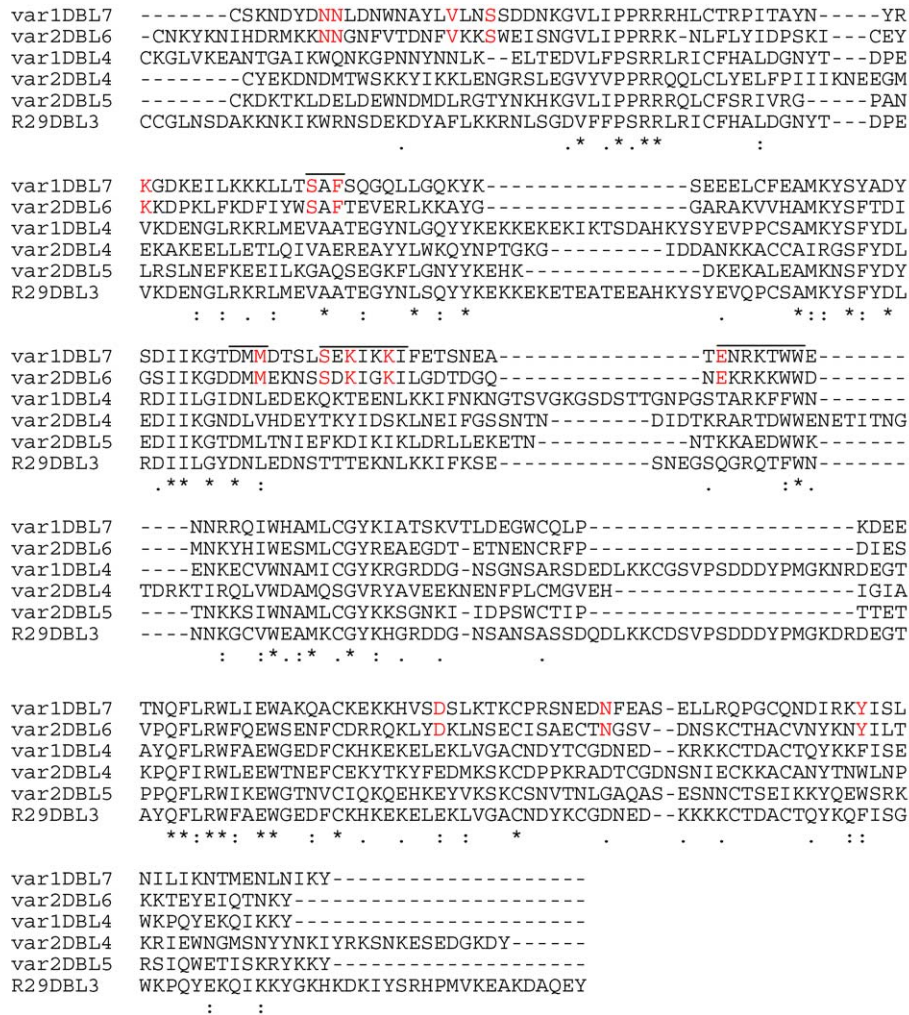
Fig. 2. Sequence alignment of the five, var1CSA and var2CSA , epsilon domains and R29var1 DBL3ε domain. Multiple sequence alignments were carried out using ClustalW software available at http://www.ebi.ac.uk/clustalw/ . Amino-acids specific for the two IgM binding domains ( var1CSA DBL7 and var2CSA DBL6) are shown in red, and motifs are indicated by a line. Symbols: * indicates conserved residues; : indicates conservative substitution; . indicates semi-conservative substitution.

invasion and cytoadherence (to CR1 and CSA) map to central regions of DBL domains. The sequence of the 3D7 var2CSA allele shows the same motifs with only one conservative substitution, “SAI” instead of “SAF”. Future work will characterise the role of these motifs in a broad range of IgM natural antibody binding domains.